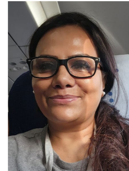
Rumi Creative Head